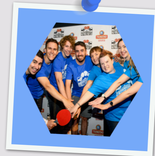
Compete, party and play in The Ping Pong Challenge Show!