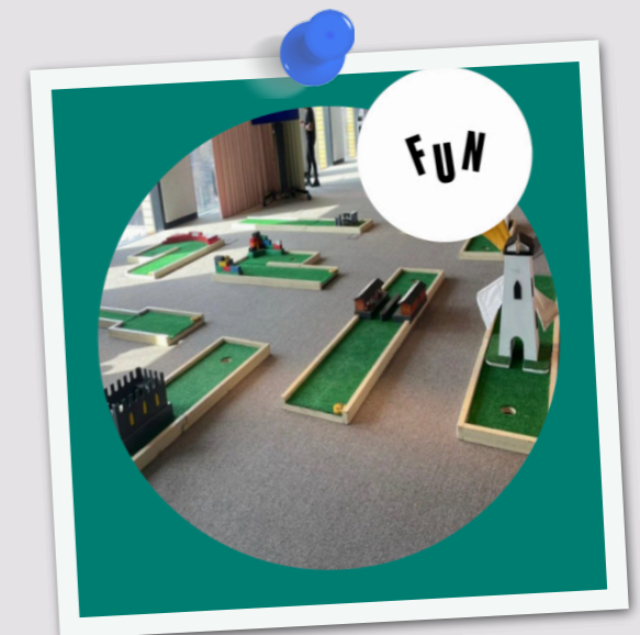
Putt 9 holes in the office with The Crazy Golf Challenge Show