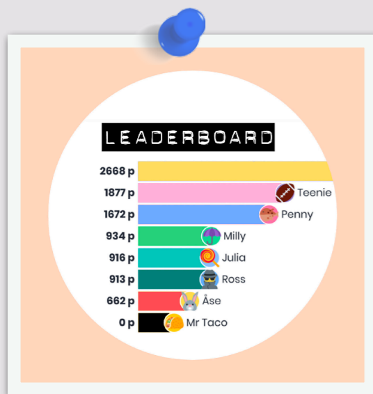
Pit your wits against your colleagues with our Interactive Bespoke Quiz