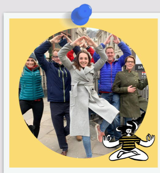
Challenge your team in Big Smoke's award-winning Scavenger Hunt