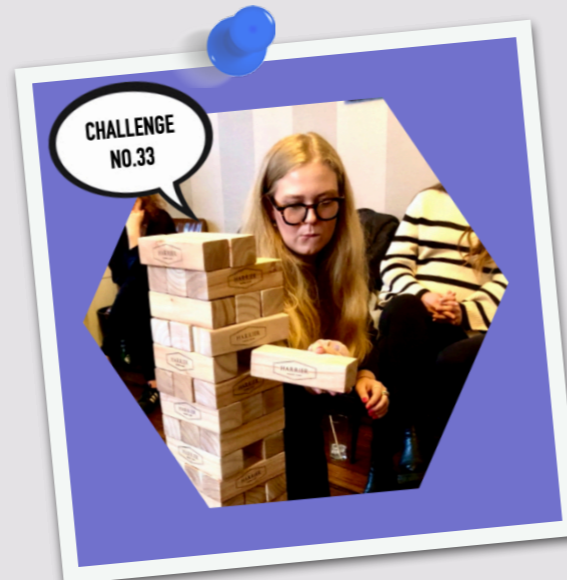
Break the ice but not the tower in The Giant Jenga Challenge Show