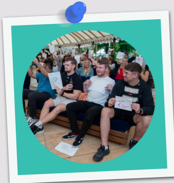
Eyes down and look in with our Bingo Challenge Show

Choose from a spectacular range of in-person, hybrid, and virtual offerings: