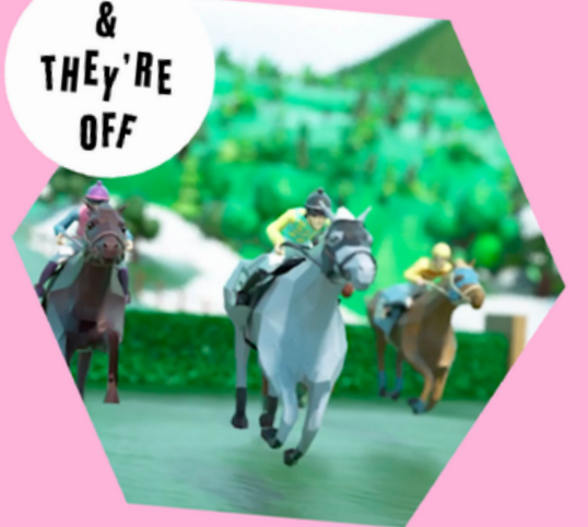
Bet, train, and sabotage horses with our team Horse Racing Game