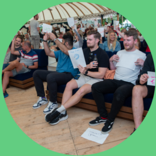
Eyes down and look in with our Bingo Challenge Show

Choose from our spectacular range of events;