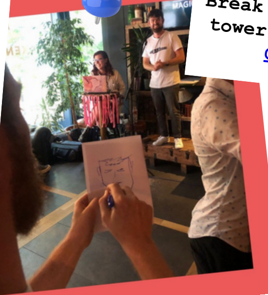
Be beguiled and amazed with our Magic Bingo