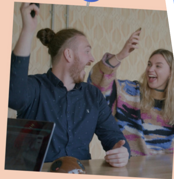
Pit your wits against your colleagues with our Bespoke Interactive Quiz