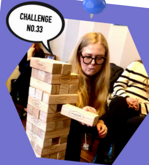
Break the ice but not the tower in The Giant Jenga Challenge Show